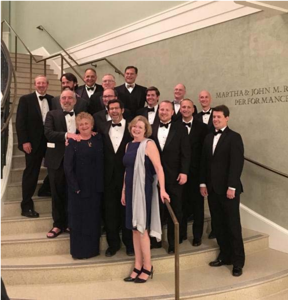
GAILLARD CENTER OPENS TO UNANIMOUS ACCLAIM